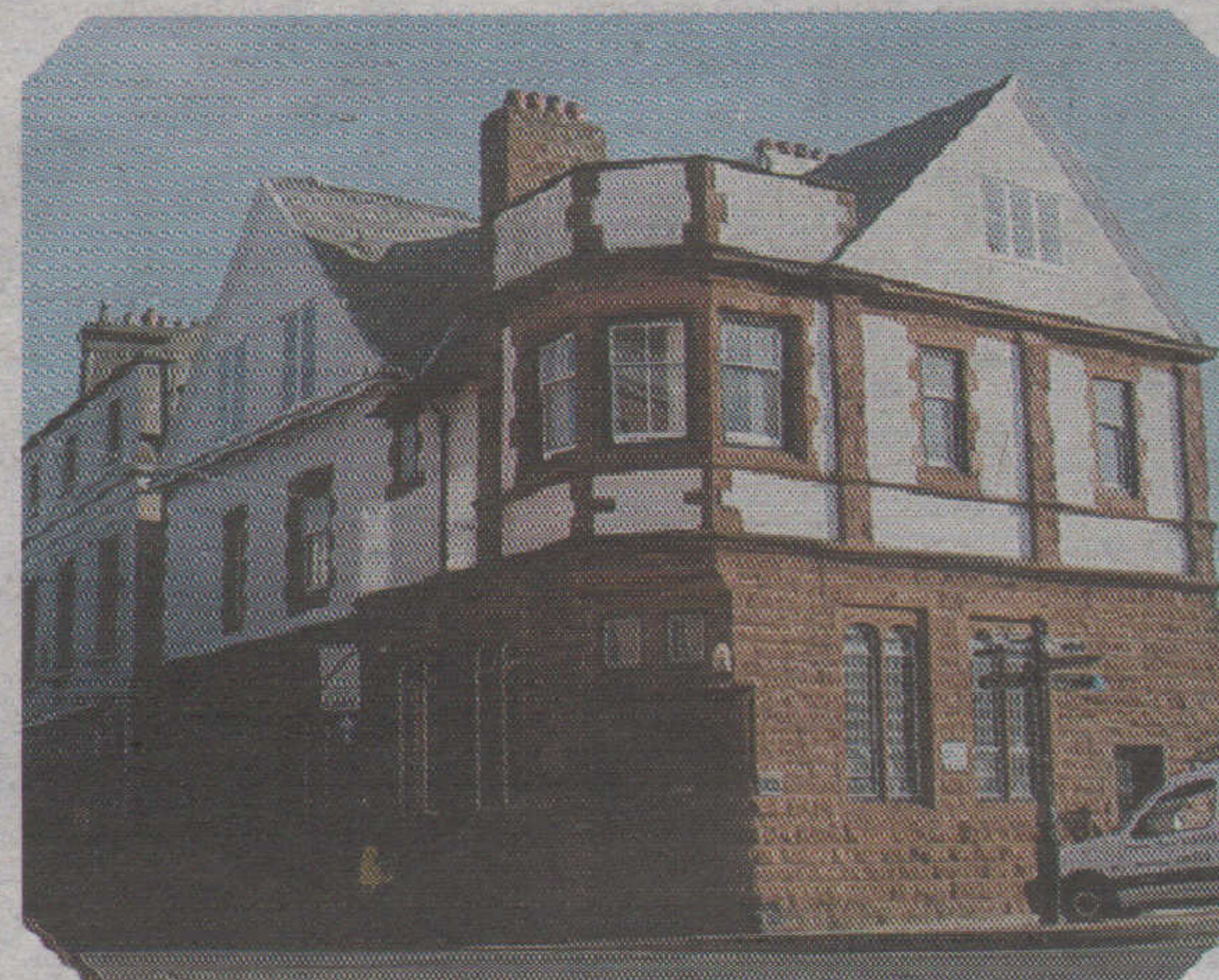
Rigby used red sandstone in his design for a bank using local materials in Market Place, Peel. The building was later the town's Post Office and is now home to a vet's surgery