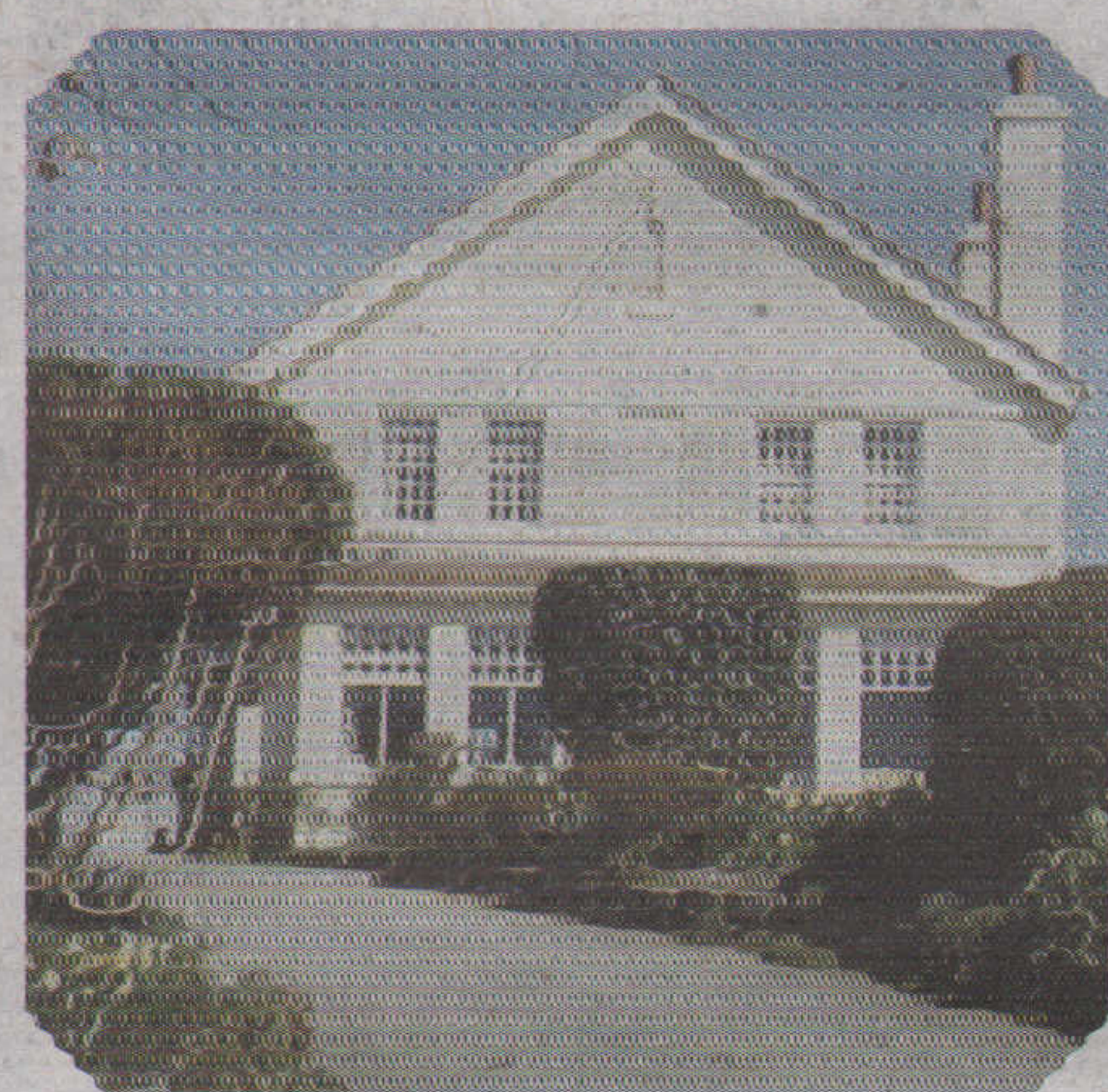
Ballahowin, near St Mark's was built for the gentleman farmer. It has lost the two chimney stacks on the left-hand side, but is generally more intact than its twin at Oatlands Farm in Santon