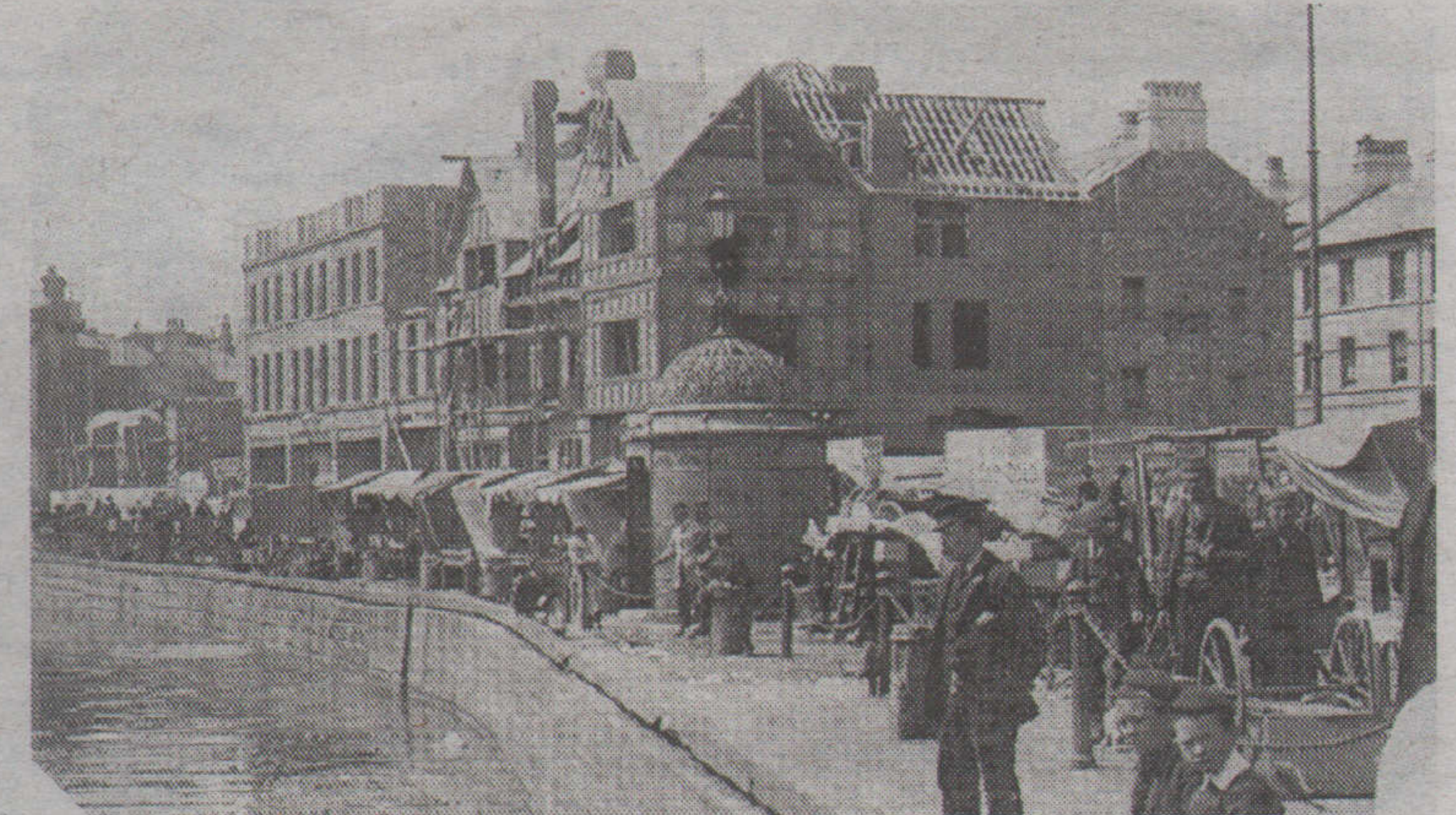
The British Hotel under construction in 1897. Rigby designed it so it was a proper half-timbered construction of heavy oak timbers with brick infill which was then plastered and painted. His design incorporated a large assembly room on the first floor for special events. This is now known as 'The Embassy'

'[Rigby was] one of the more significant architects working on the island...'